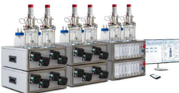
PHOTO BIOREACTORS & AIR LIFT

Systems can be used for microbial and cell cultivation applications in research and development allow for advanced screening of bacteria, yeasts, fungi, Cell Culture, Stem Cell, Biofuels and Phototrophic organisms. Our systems guarantee high precision monitoring and control for each bioreactor with a trusted parallel hardware and software PLC based which result in high information output and easy comparative analysis.